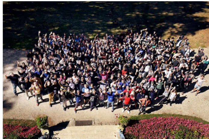
The 294 new students of the 2019 class joined IFP School on September 3 in the 11 applied industrial graduate programs. A stable number compared to the 2018 promotion, with the same scope of consolidation.